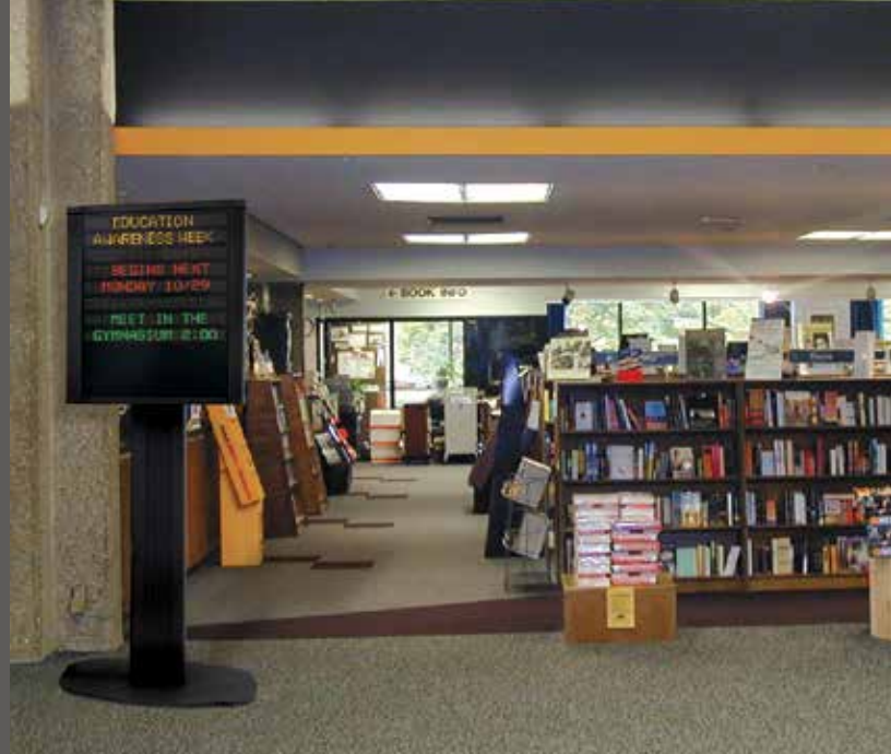
Indoor Multi-line Alpha Director