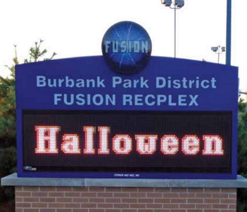
Outdoor Full Color A Series 20mm RGB 32x128